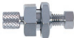
Bulkhead internal/external reducing union (EZBRU.51)