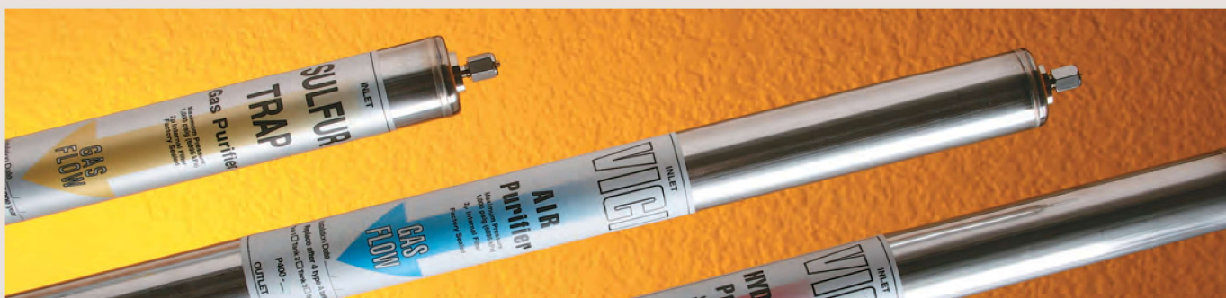
GAS-SPECIFIC PURIFIERS AND CONTAMINANT TRAPS