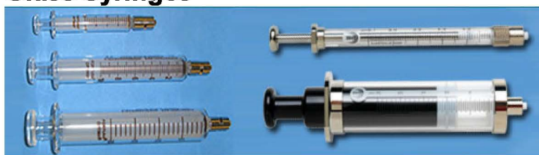
Standard Glass Syringes