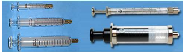
Standard Glass Syringes