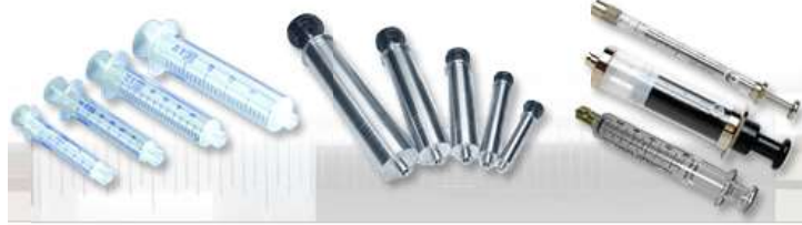
Disposable Plastic Syringes Plumbing Supplies